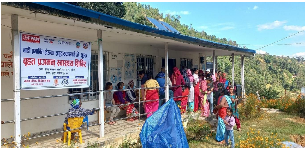
Clients wait in line for SRH services