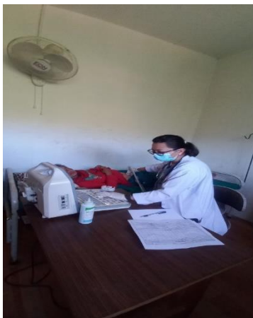
Doctor is providing USG services to pregnant women (left)