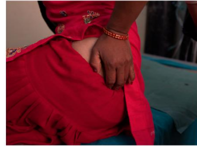
Nirmala, 26, receives temporary family planning services at the SRH health camp in Lalitpur