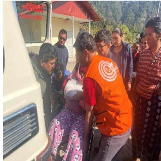
Helping a client with hand fracture to refer to a higher centre