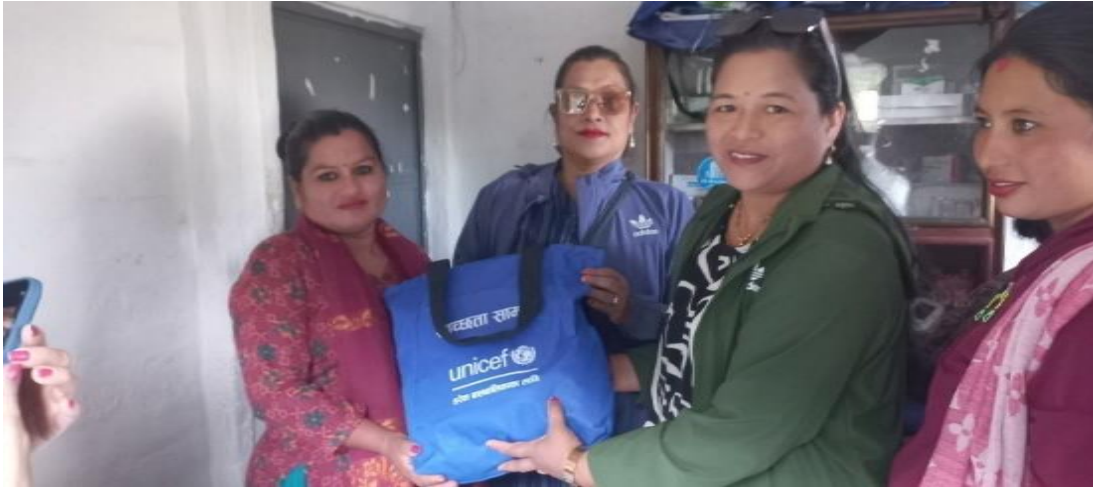
FPAN central committee volunteers distributing hygiene kits to pregnant women.