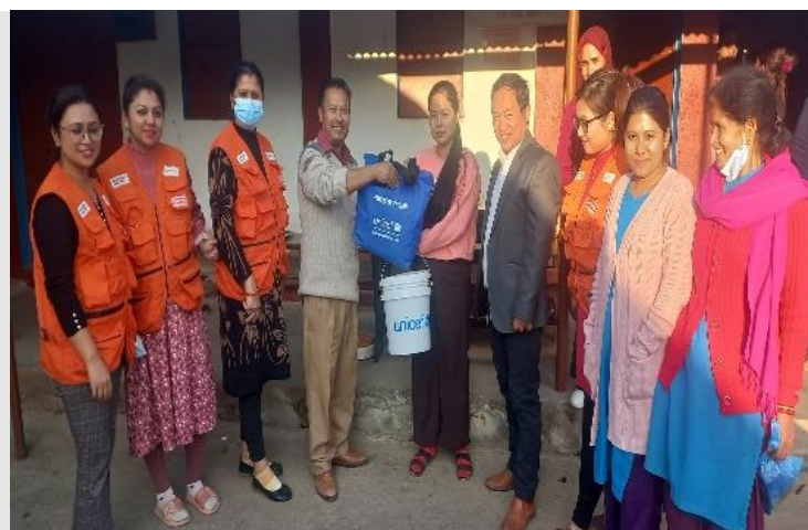
Ward chairman of Panchkhal municipality distributing a dignity kit to a pregnant woman (right)