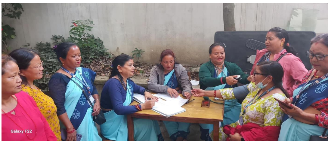
Client registration by a Female Community Health Volunteer (FCHV)