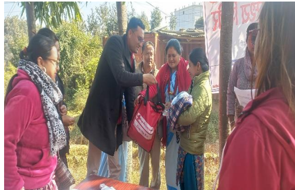
Ward chairman is distributing dignity kits