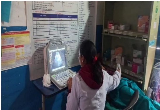
USG scanning of pregnant women by a gynae doctor